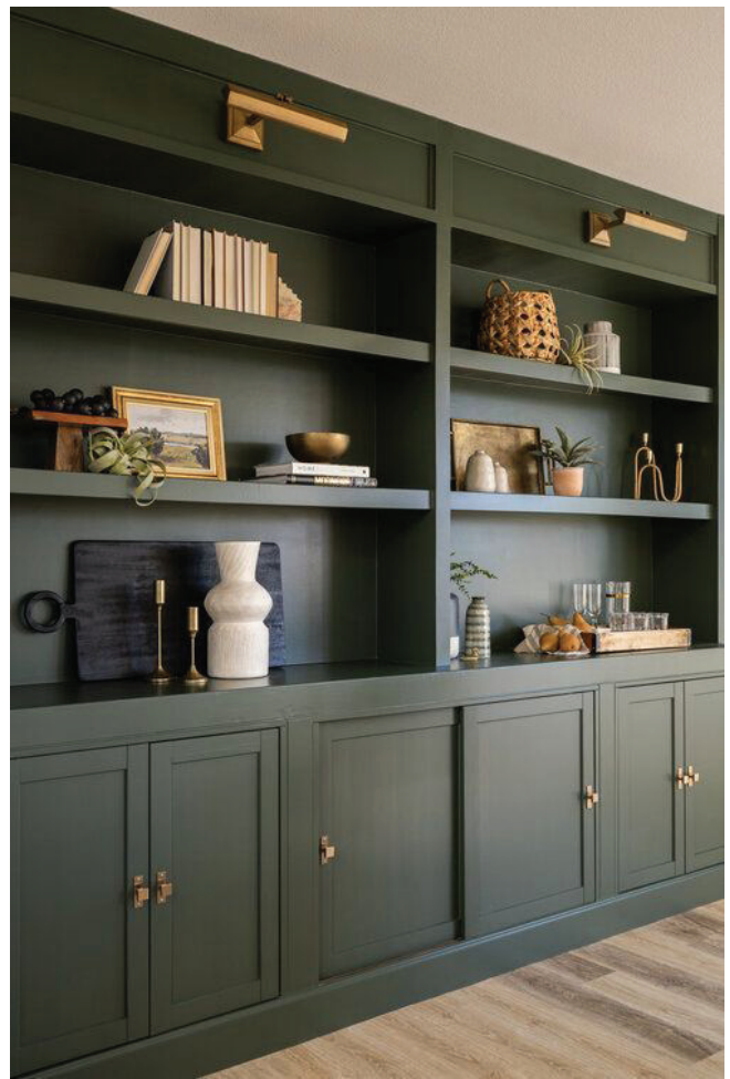
Dark, warm toned bookcases with inset lighting and built in storage