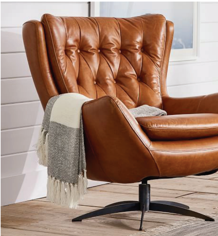
Comfortable seating intended for lingering and conversations