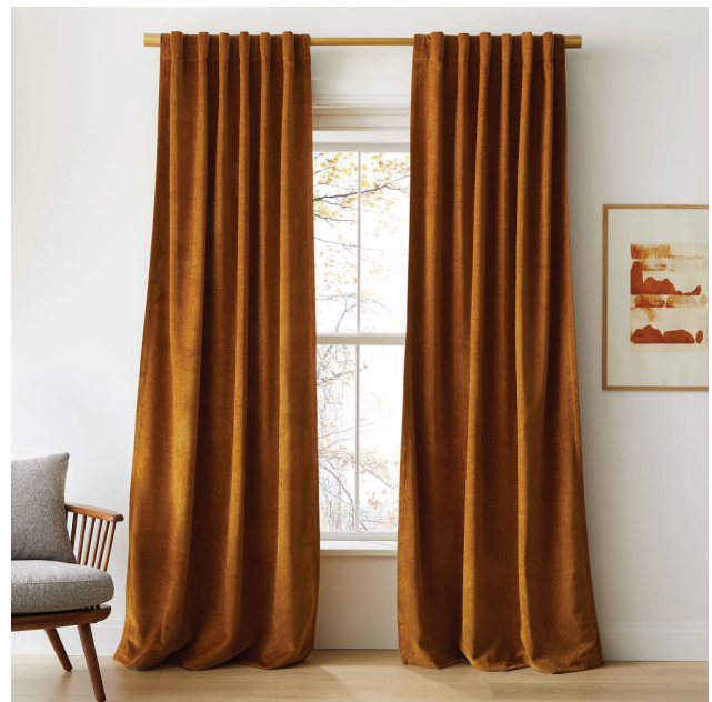
Floor to ceiling drapes in a warm, earth tones will soften sound and lend a lush vibe.