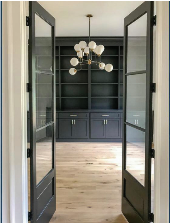
Welcoming/inviting entrance with new flooring throughout