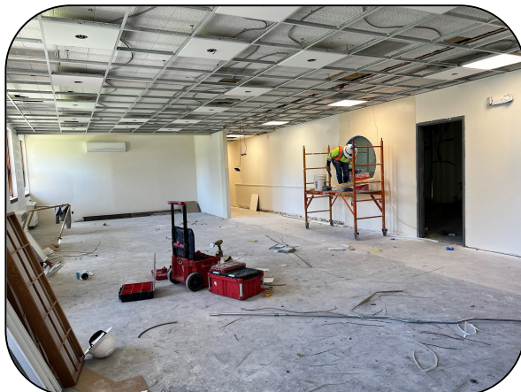
Our children's wing lost a wall and has been reconfigured a bit.