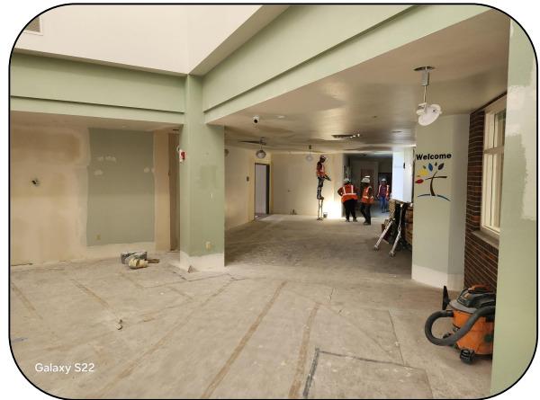
The west entryway looks and feels very different these days!