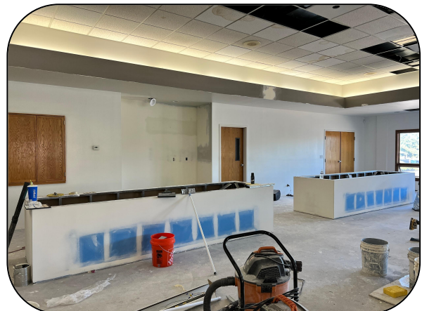
New permanent serving counters in Chadwick Hall.