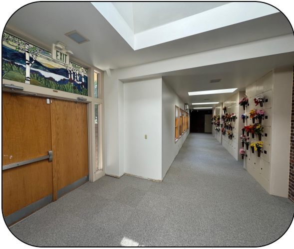
New paint & carpet in columbarium, as well as new 3D printed vases, thanks to the UNC Arts Department.

Change is upon us as the interior renovations for the capital campaign really begin to take shape! While the first few months of construction felt like it moved very slowly, we've finally reached the point where progress is visible nearly daily. We are on schedule to have construction complete by mid-October. Hooray!