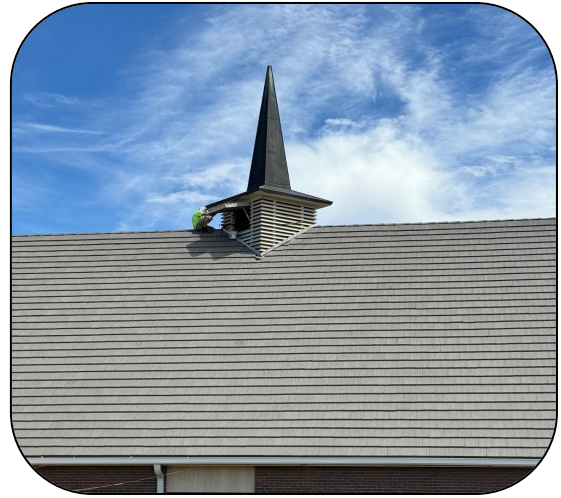
Steeple and soffit painting - a very tall job!